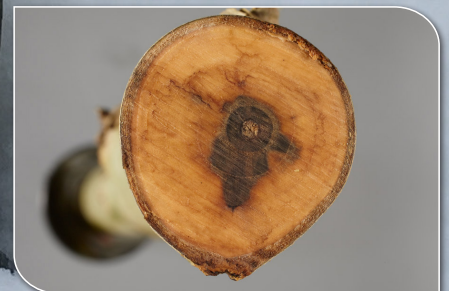
Woodland Plans Getting it right