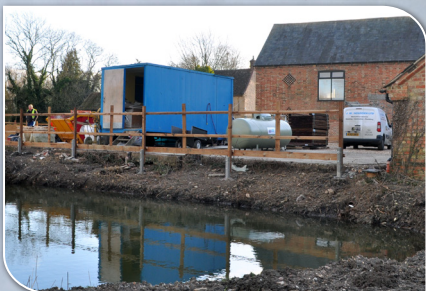
Equestrian Centre Big changes afoot...

Snow and the wettest year on record bring their own challenges and beauty!