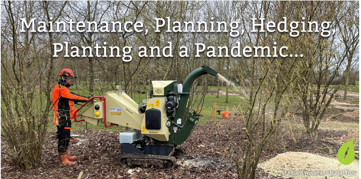
St Albans Woodland Burial Trust